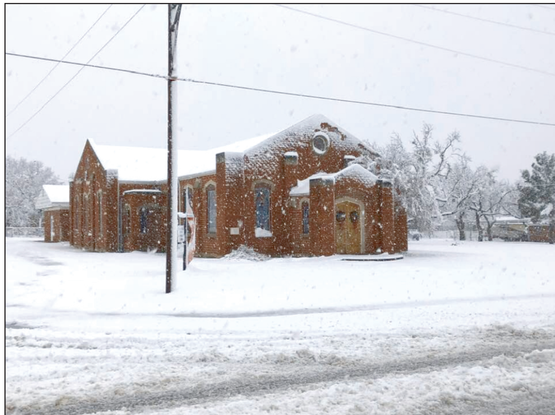
Beautiful But Cold! A sudden snow storm blew across parts of Coke and Nolan counties Thursday afternoon with huge, wet flakes and high winds. Highway 70 between Blackwell and Sweetwater was closed and one of the Blackwell CISD buses was among the vehicles stranded for awhile. Above is the Methodist Church in Blackwell.

When we talk about revitalizing our communities, it is