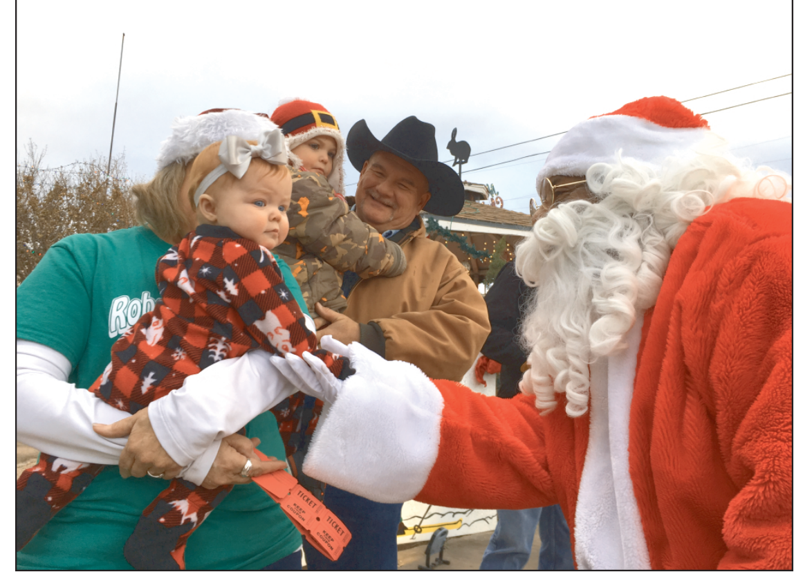
Small Town Christmas in Robert Lee