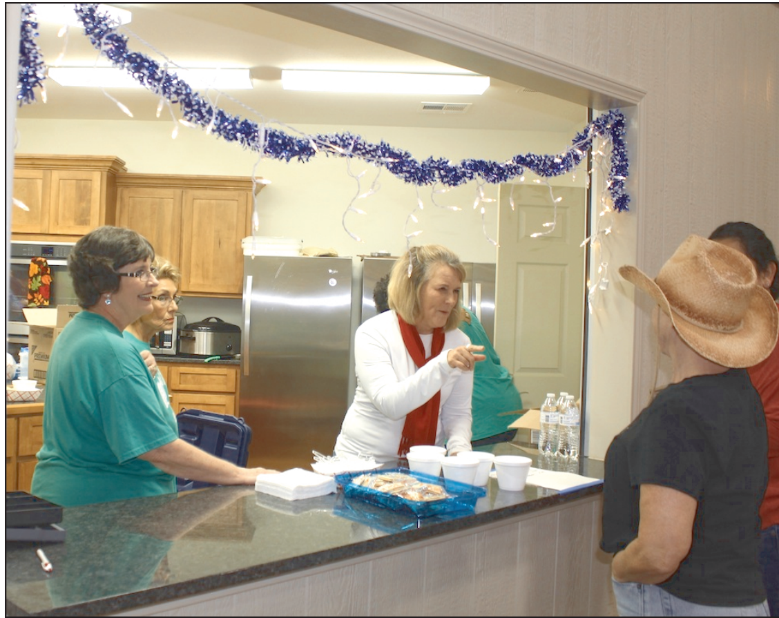
Robert Lee's Small Town Christmas! Delicious stew and cornbread were served during Robert Lee's Small Town Christmas celebration Saturday evening, December 2, 2017. The event was sponsored by Vision with a Purpose.

If you would like to submit your name for consideration for a term appointment as a Board Member or are interested in