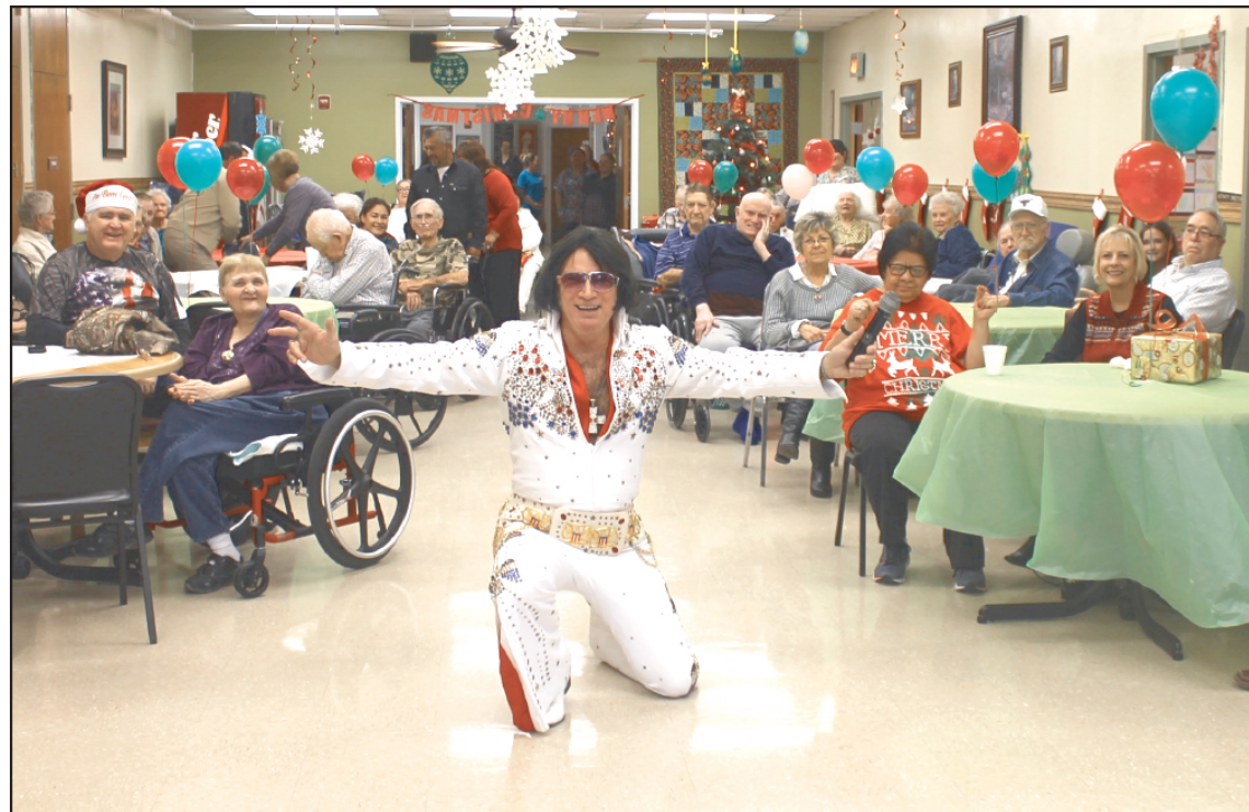
An Elvis Christmas! Residents of Bronte Health & Rehab Center were entertained recently by Elvis at their annual Christmas party.

Plans for the staff Christmas party were formulated, and