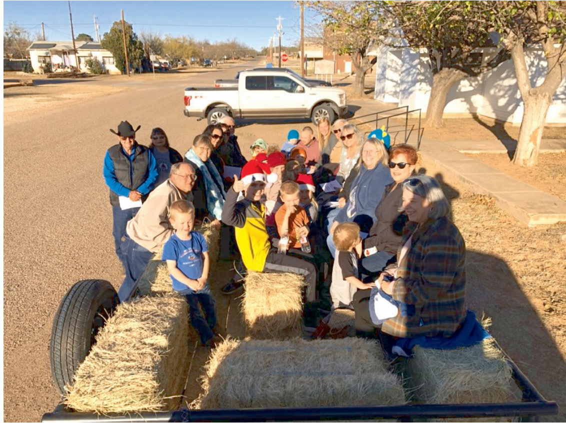
Singing Hayride! On Saturday, December 11, Robert Lee's Northside Church of Christ family and friends enjoyed a hayride to sing Christmas carols to people in their community. One special stop was to the Robert Lee Care Center to sing to residents there. After caroling, hot chocolate, sandwiches, and snacks were enjoyed by all.

Last year, the Christmas Dinner was a victim of COVID-19. After extensive planning for a safe delivery of meals, numerous volunteers were quarantined on Christmas Day with COVID or COVID exposure (including myself). It was a heartbreaking turn of events. This year, the Christmas Dinner will prevail! We will take adequate health and safety precautions. We will be mindful of social distancing and