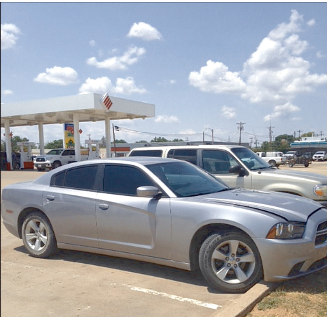
Stolen Vehicle Recovered! This Dodge Charger was stolen in San Angelo last Friday morning, August 4, 2017. It was recovered during the lunch hour that day by Coke County Sheriff's deputies at the Stripes in downtown Bronte. The case is currently under investigation by the Coke County Sheriff's Office and the San Angelo Police Department.