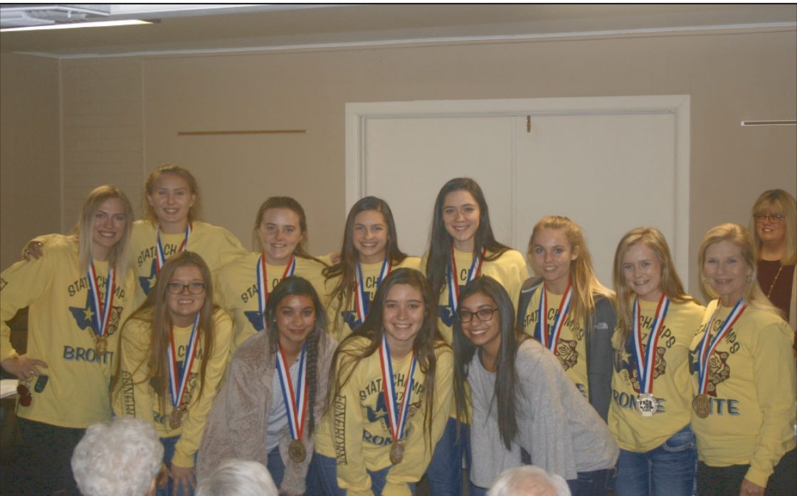
Lady Longhorns Honored! The Bronte Lady Longhorns Volleyball Team was honored Thursday night, December 14, 2017, by the Bronte City Council for winning the State Volleyball Championship.