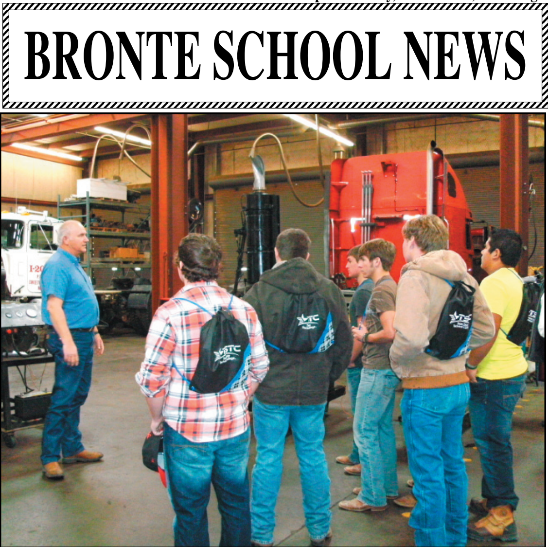
TSTC Field Trip! A group of seniors from Bronte High School recently toured the Texas State Technical College (TSTC) in Sweetwater. The students got to visit the different programs offered at TSTC such as Diesel Mechanics, Automotive Technology, Robotics, Wind Energy and the Computer Sciences department, as well as visit the Student Recreation Center, admission's office and financial aid offices. The students had the opportunity to talk to the instructors and ask questions and were also provided with backpacks that contained additional information about TSTC. For more information about TSTC, please visit www.tstc.edu .

Holiday time is travel time in Texas, and what better occasion to take in some of the newly restored historic sites throughout the Lone Star State? From the adobe