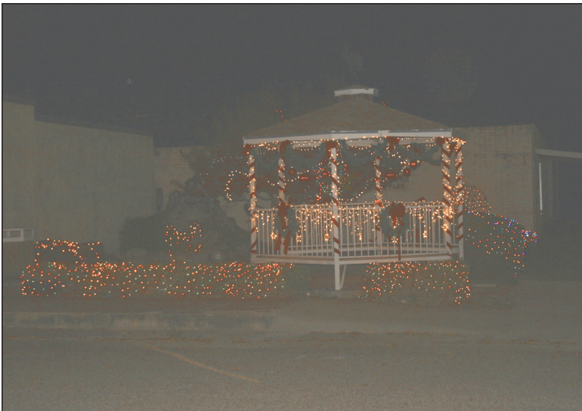
Small Town Christmas! Attendees at Robert Lee's Small Town Christmas enjoyed having their photo taken and viewing the lovely decorations. The gazebo in the Mini-Park between Robert Lee City Hall and the Coke County Library also received a holiday makeover and was adorned with lights and festive decor.

Toast with jelly, scrambled eggs, sausage, fruit, juice, milk