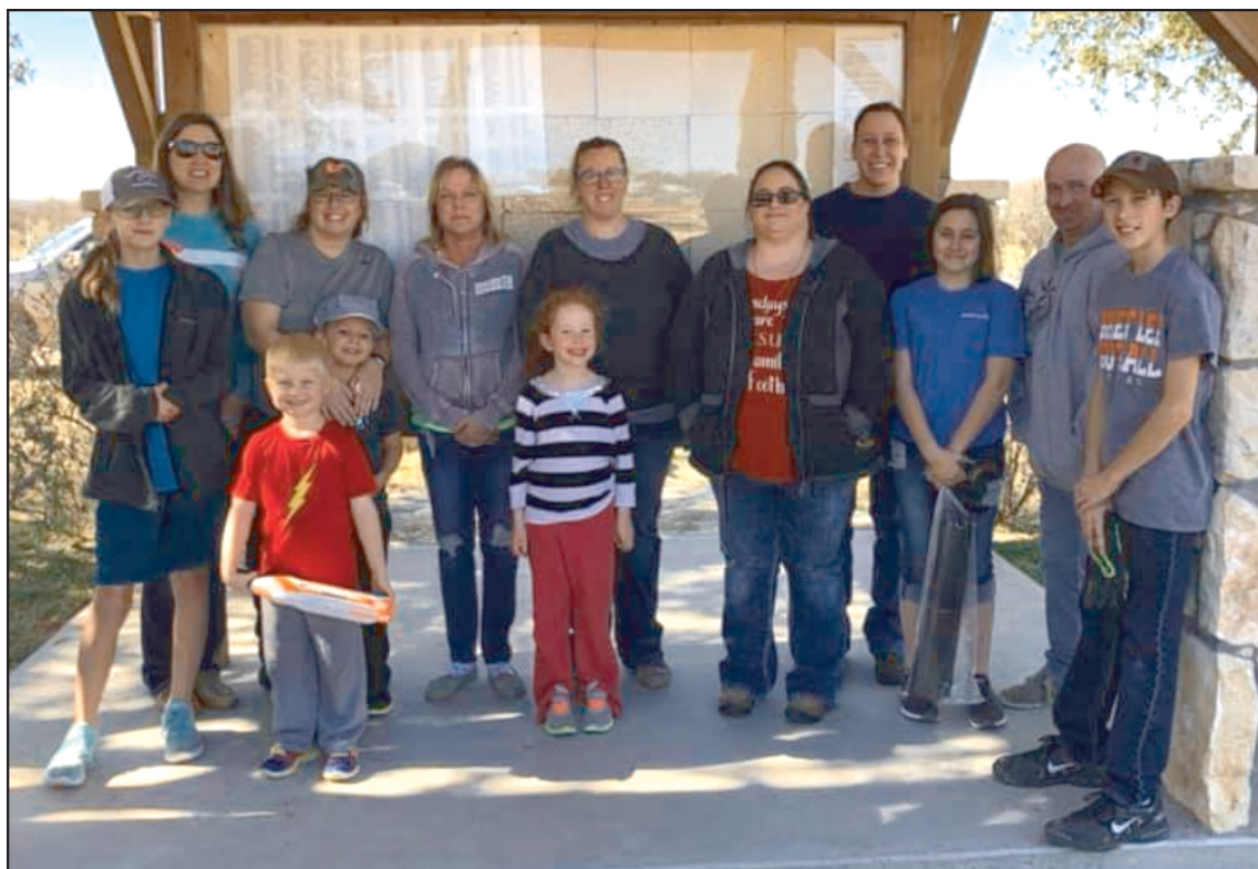
Clean Up Day! Several members of RLRestoration gathered together on Sunday, January 27, for a clean up day at the Robert Lee Cemetery.