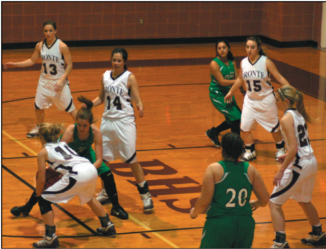
BHS Basketball! The Bronte Lady Longhorns (above) are in the second round of district basketball. They are sitting in second place for district play and will advance in the playoffs. The Bronte Longhorns (next page) are in the second round of district basketball. They are tied for second place in district play and plan to advance in the playoffs.