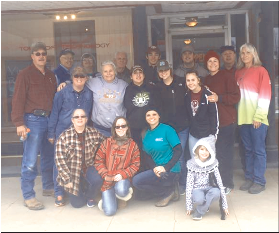
RBF Cleans Up! Restoring Bronte Foundation held their quarterly clean-up Saturday morning, February 4, 2017. Volunteers came out in force to help elderly and disabled residents clean up yards and vacant lots. Employees of Coke County Precincts 2 and 4 (bottom photo) assisted with limb removal during the clean up.