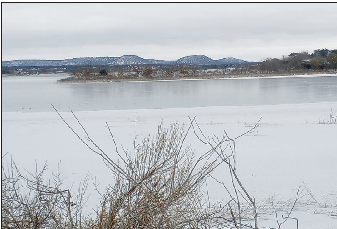
Frozen! Beginning midday on Tuesday, February 16, 2021, Oak Creek Lake was beginning to freeze due to the very cold conditions Coke County has been experiencing recently.

Per Year in Coke County ... $30.00 Per Year Elsewhere in Texas ... $35.00 Per Year Outside of Texas ... $37.00