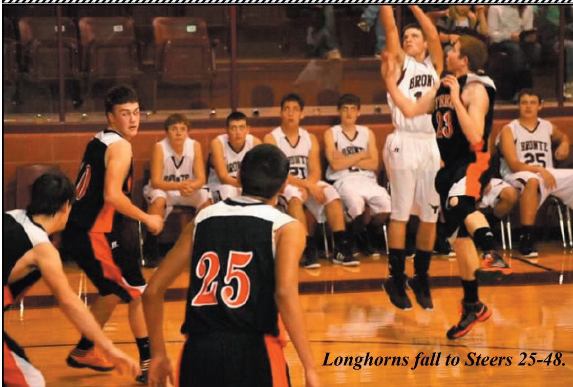
Longhorns fall to Steers 25-48.