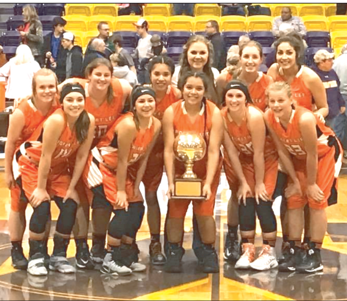
Lady Steers! The Robert Lee Lady Steers took the Bi-District championship by defeating the Rotan Yellowhammers 60-29 on February 14, 2017. This year's playoff run ended when the Lady Steers were defeated by the May Lady Tigers during the Area Round of the playoffs, 50-61.