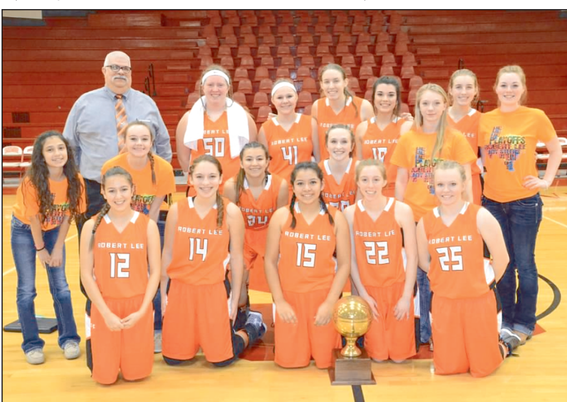
Lady Steers Take Bi-District Championship! The Robert Lee Lady Steers were named the Bi-District Champions following their win over the Trent Lady Gorillas in Sweetwater Tuesday, February 16, 2016. They next faced May's Lady Tigers for the Area title in Coleman and fell short 35-38. Congratulations on a very successful season.

There will be a meeting for the Sanco Homecoming Association Sunday, March 6, at 2 pm at the Sanco Pavillion, weather permitting. Refreshments will be provided.