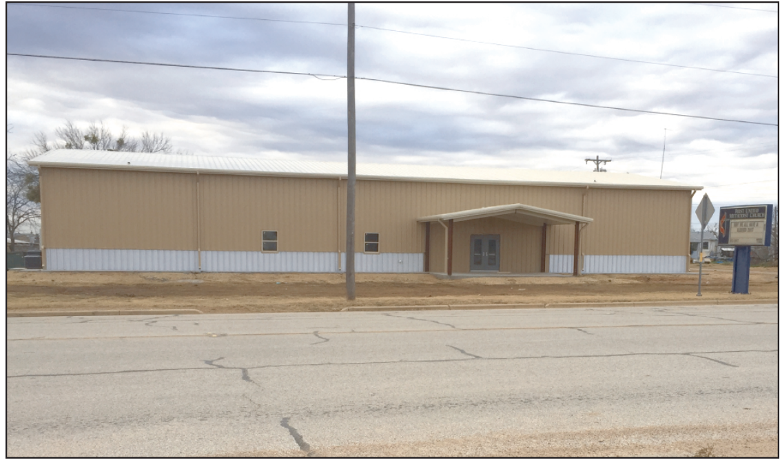
New Church Building! The new activity center for First United Methodist Church in Robert Lee is coming along nicely. Construction of the center should be completed in March of this year.