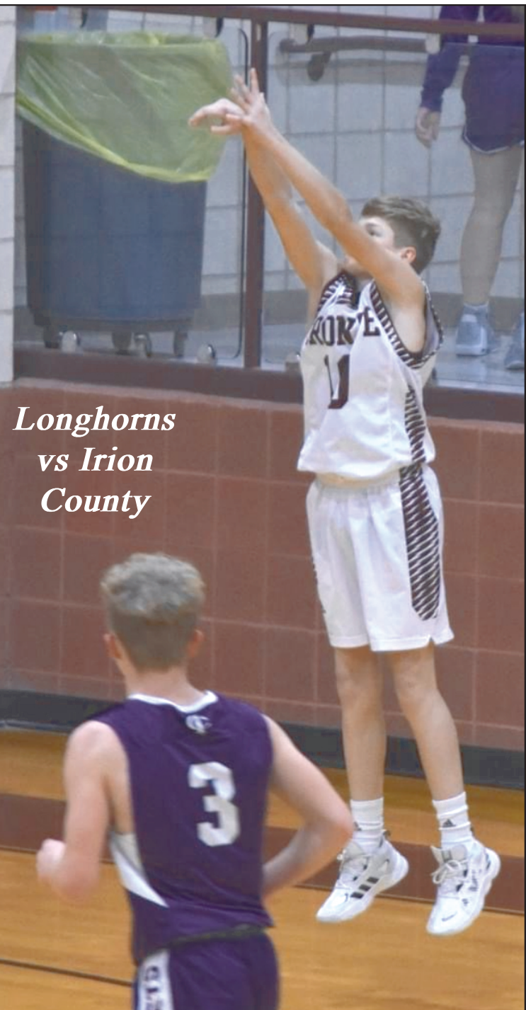
Longhorns vs Irion County