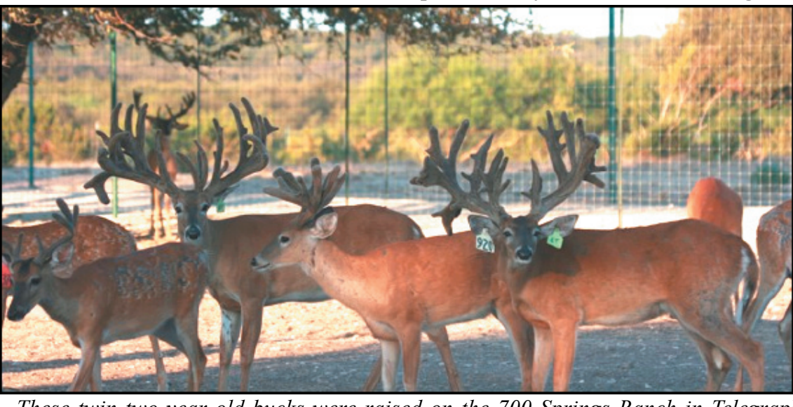
These twin two year old bucks were raised on the 700 Springs Ranch in Telegraph,

stand your ground and raise your arms, backpack or jacket to appear larger, and yell at the bear to scare it off.