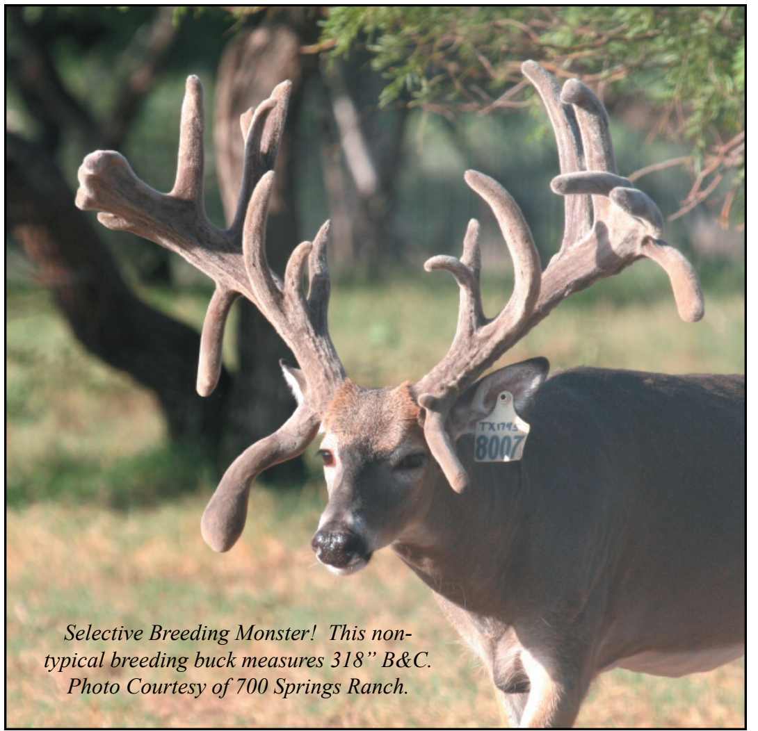
Selective Breeding Monster! This non-typical breeding buck measures 318" B&C.