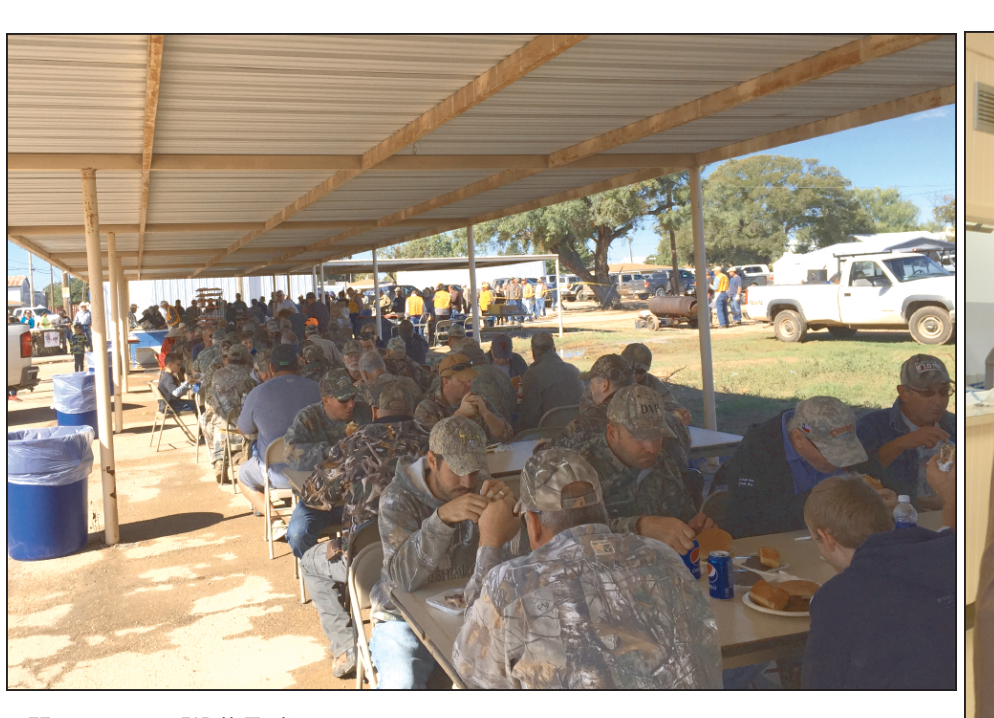
Hunters are Well Fed! Hunters from around the area attended the BBQs held in both Bronte (above photo) and Robert Lee (right photo) last year. This year's BBQ in Bronte will be held at lunch on opening day of deer season, November 5, and Robert Lee's BBQ will be held Saturday evening, November 12, 2016.