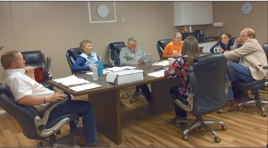
Council Meeting! The Robert Lee City Council meeting on Tuesday evening, February 26, 2019, proved to be a tense affair.