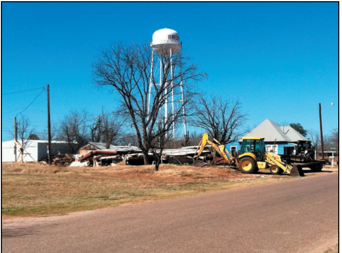
Bronte Renovation! This home on West Jackson Street (below) and the mobile home (above) on Southwest Railroad in Bronte were demolished this week in preparation for the new homes which will be constructed on the sites as part of a grant program the City of Bronte received. Several years ago, Bronte participated in this grant program which provided five families with new homes. This year's participation in the program will assist five additional families.

Blackwell CISD will host the Junior High Ribbon Relays on Tuesday, March 26,