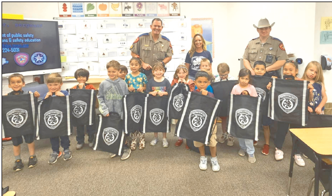
Safety Program! Troopers with the Texas Department of Public Safety visited Robert Lee Elementary to present their “Be Smart, Be Safe Program” to students.

Wednesday, March 20 Power breakfast, fruit, juice, milk Thursday, March 21 Strudel, cheese, fruit, juice, milk Friday, March 22 French toast, sausage, fruit, juice, milk Lunch Monday, March 18 Burger, fries, oranges, pudding, milk Tuesday, March 19 Chili and cheese tots, fresh veggie cup, strawberries and bananas, cake, milk Wednesday, March 20 Asian bowl, carrot coins, steamed broccoli, grapes, milk Thursday, March 21 Breaded mozzarella sticks, marinara sauce, red bell pepper strips, pears, milk Friday, March 22 Chicken strips, fries, gravy, bread, cucumbers, rosy applesauce, cookie, milk Blackwell CISD Breakfast Monday, March 18 Pancakes, fruit, juice, milk Tuesday, March 19 Breakfast burrito, fruit, juice, milk Wednesday, March 20 Pizza, fruit, juice, milk Thursday, March 21 Biscuit, sausage, scrambled eggs, gravy, fruit, juice, milk Friday, March 22 No menu available Lunch Monday, March 18 Chicken Alfredo, steamed broccoli, garlic breadsticks, milk Tuesday, March 19 Loaded nachos, Spanish rice, pinto beans, milk Wednesday, March 20