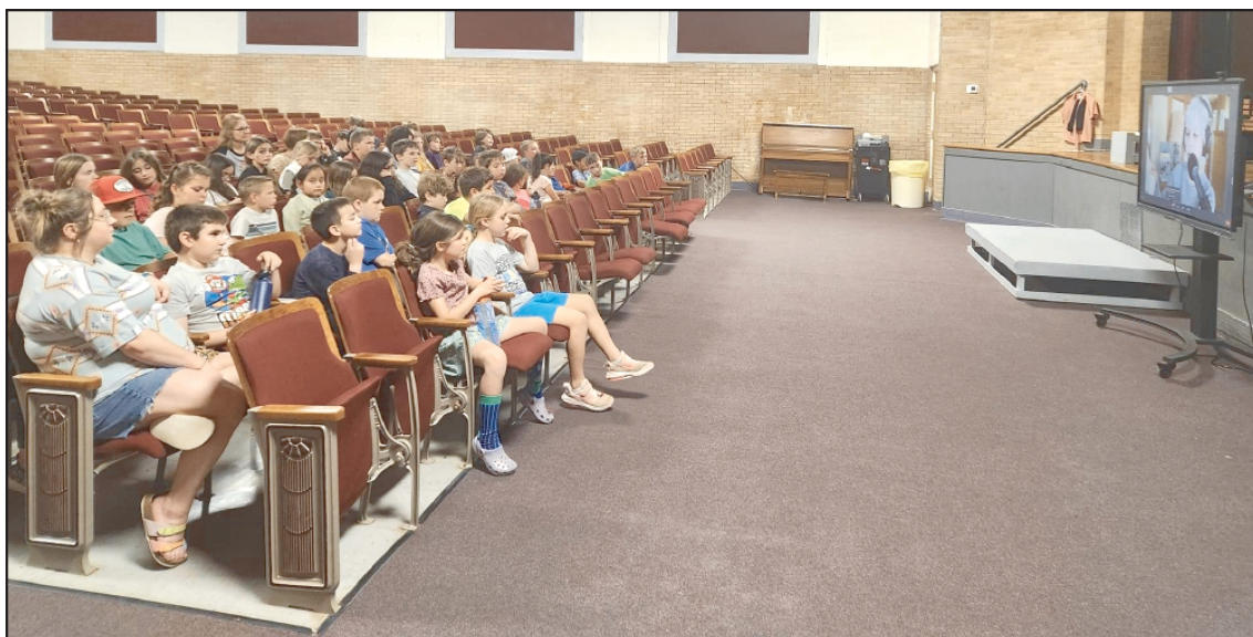
Author Visit! Students in third through fifth grades at Bronte Elementary recently had the opportunity to have a Zoom visit with author Kate DiCamillo.