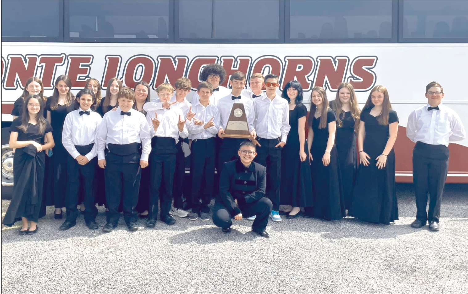
Band! The Bronte ISD Longhorn Band recently earned ones across the board at the Concert and Sightreading Contest last week.