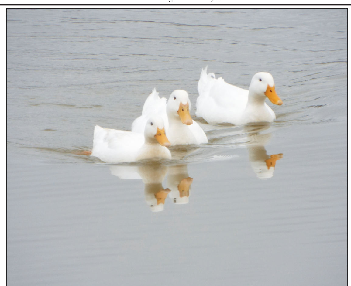
Spring Is Here!? Last week, these ducks were enjoying the lake behind the park in Bronte. Fruit trees and even some wildflowers are blooming. Does this mean spring is officially here? Not according to the big mesquite trees!

2017, to help with Utility Assistance. They will also be taking applications for the Weatherization Program.