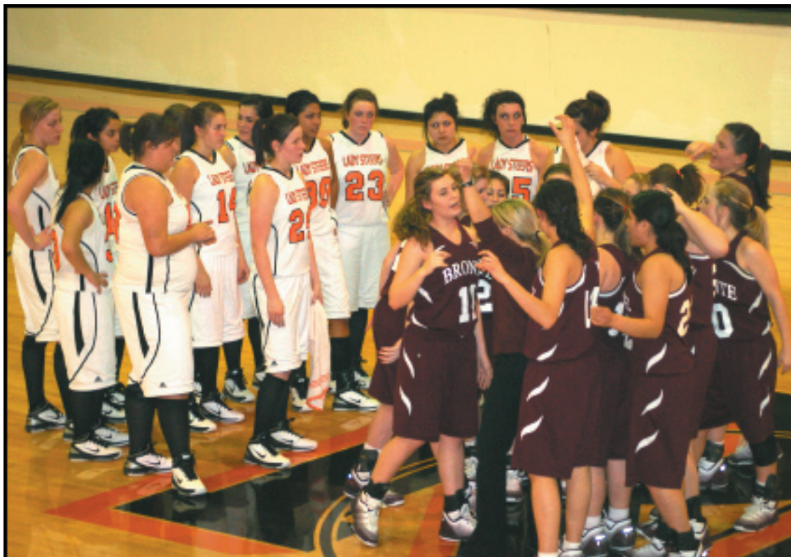
Basketball Memories! The Robert Lee Lady Steers hosted the Bronte Lady Longhorns February 8, 2011, for the final all-county game of the year.

2-4 pm and the second will be Tuesday, March 22, from 6 to 7:30 pm. A mock tryout (practice) will be held Wednesday, March 23, from 6 to 7 pm.