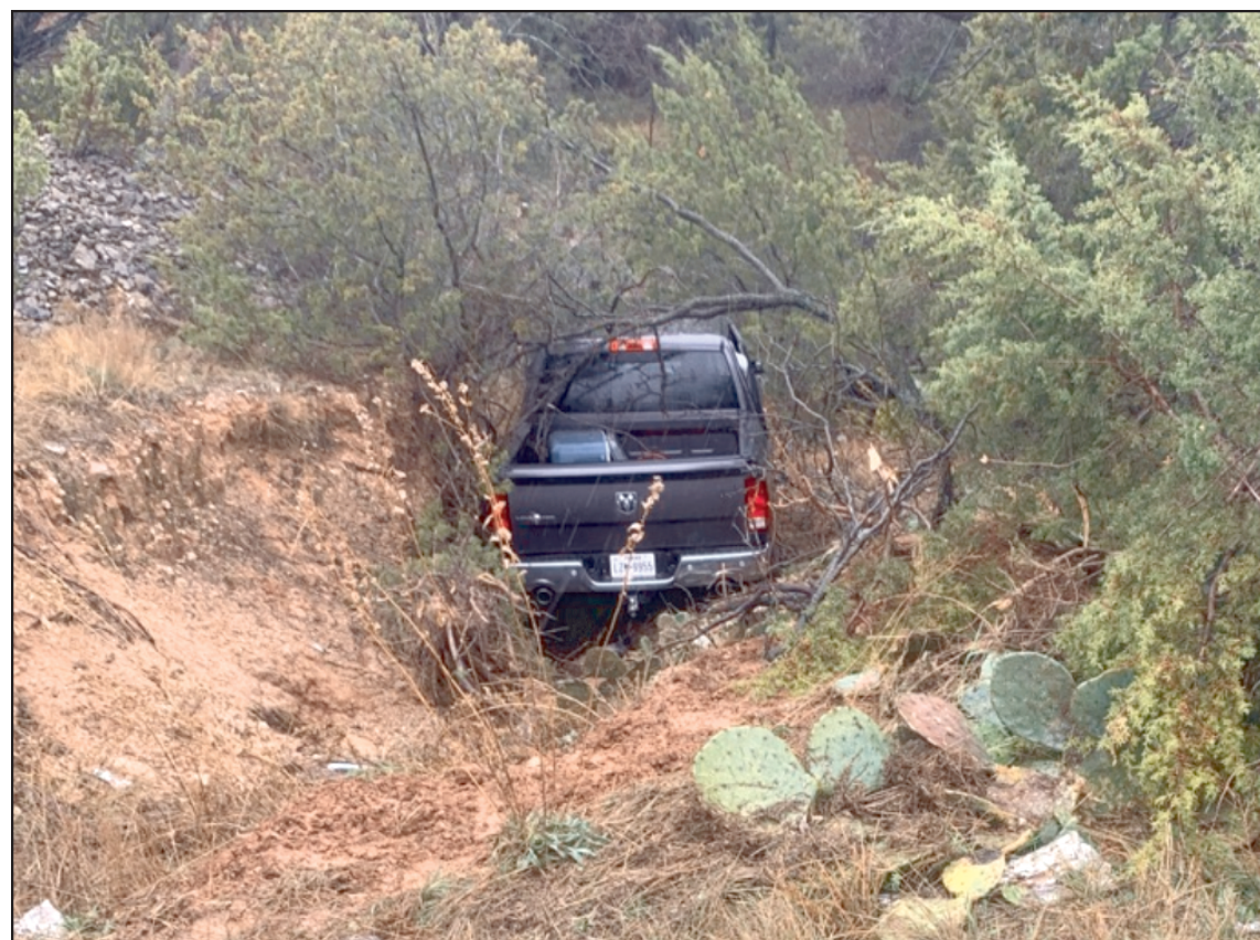
Oops! Due to the rain, this pickup hydroplaned and went off of Highway 277 south of Bronte on Wednesday, March 4, 2020. Bronte Volunteer Fire Department, East Coke County EMS, and Coke County Sheriff's Office responded to the accident.

This course is ANSI-CFP accredited and includes Certified Professional Food Manager