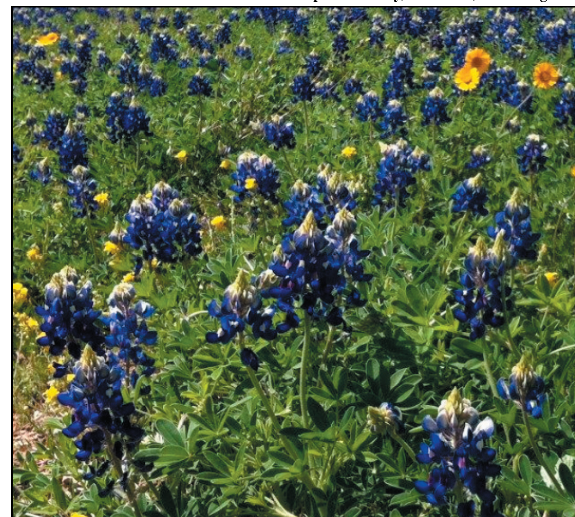
Spring is here! Officially spring began yesterday, Thursday, March 21. However, this year's wildflowers have gotten a jump on the season. Due to lack of rain, they are not as prevalent as in year's past but if you look close, you can find a few.

The Texas Midwest Guide includes community information, attractions, recreation, lodging, regional calendar of events, unique shopping and