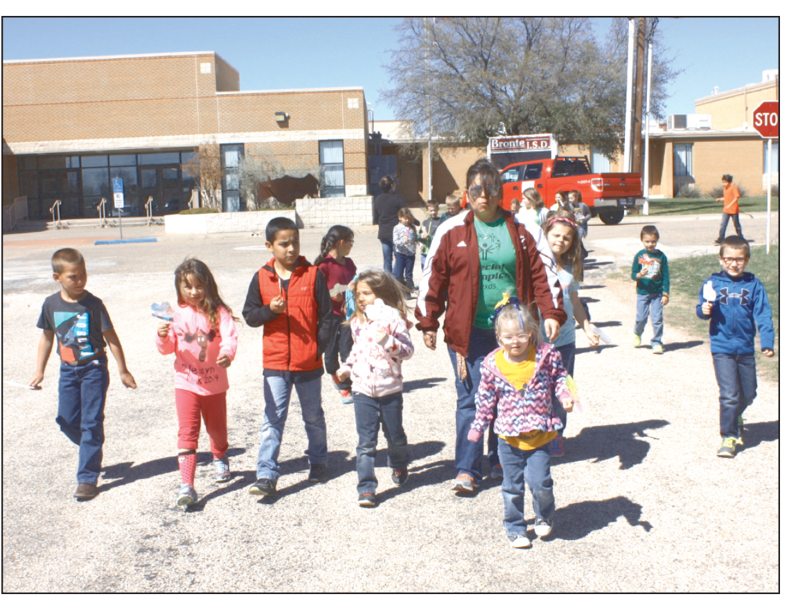
Buddy Walk! On Monday, March 21, Bronte Kindergarten and Third grade students went on a Buddy Walk around the school. This walk was to promote Down Syndrome Awareness.