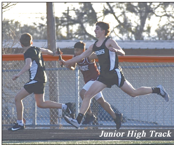
Junior High Track

Applicants must be a CVEC member, or dependent of a member, whose primary residence is served by the cooperative. Scholarship recipients are chosen by an independent committee