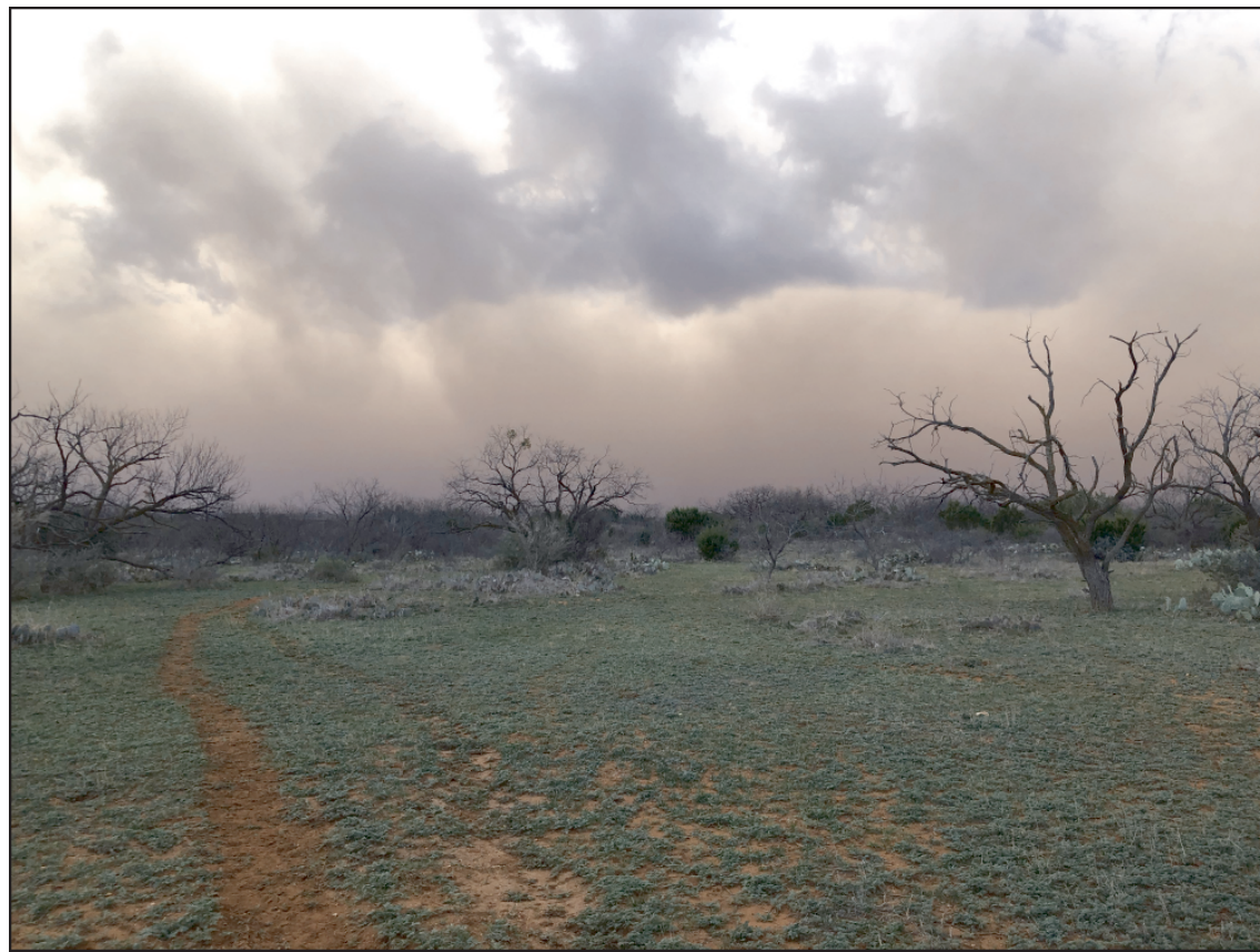
Dirt Storm! A very rare Dirt Storm Warning was issued to Coke County, as well as surrounding counties, on Tuesday evening, March 22, 2021. The dirt was readily visible in the sky to the west before the winds picked up and dropped visibility to near zero.