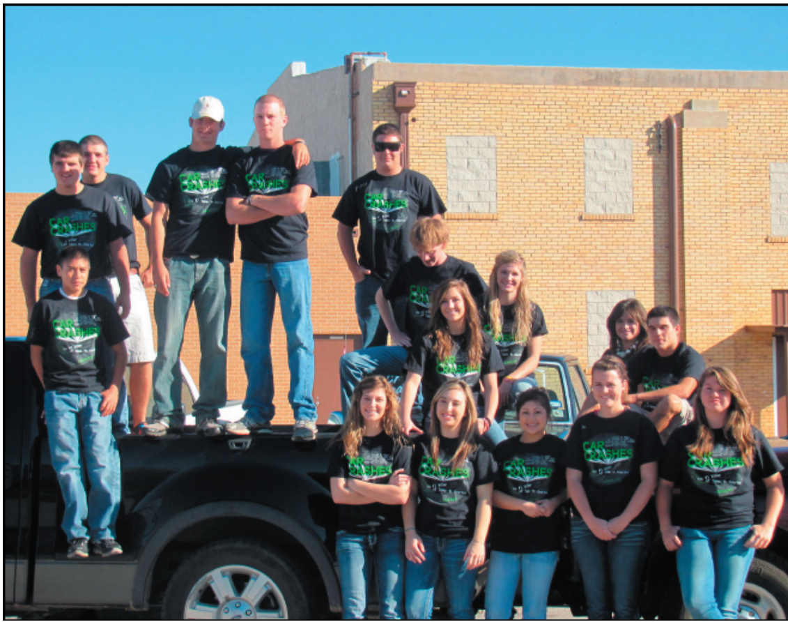
Granger Smith coming to BHS! Bronte High School's Teens in the Driver Seat (above photo) sponsors many activities throughout the year to promote safe driving habits for teens and to remind them of distracted driving risks and the importance of wearing seat belts. This week they will be sponsoring an event to remind kids to be safe before Prom; which will be Saturday, May 31. Granger Smith, Texas Country singer, will be the presenter for this event and he will be performing some of his songs as well. Area schools have been invited and local communities are also invited to attend because distracted driving affects everyone. The event will begin at 2:45 pm on Friday, May 30 in the Bronte School Auditorium.