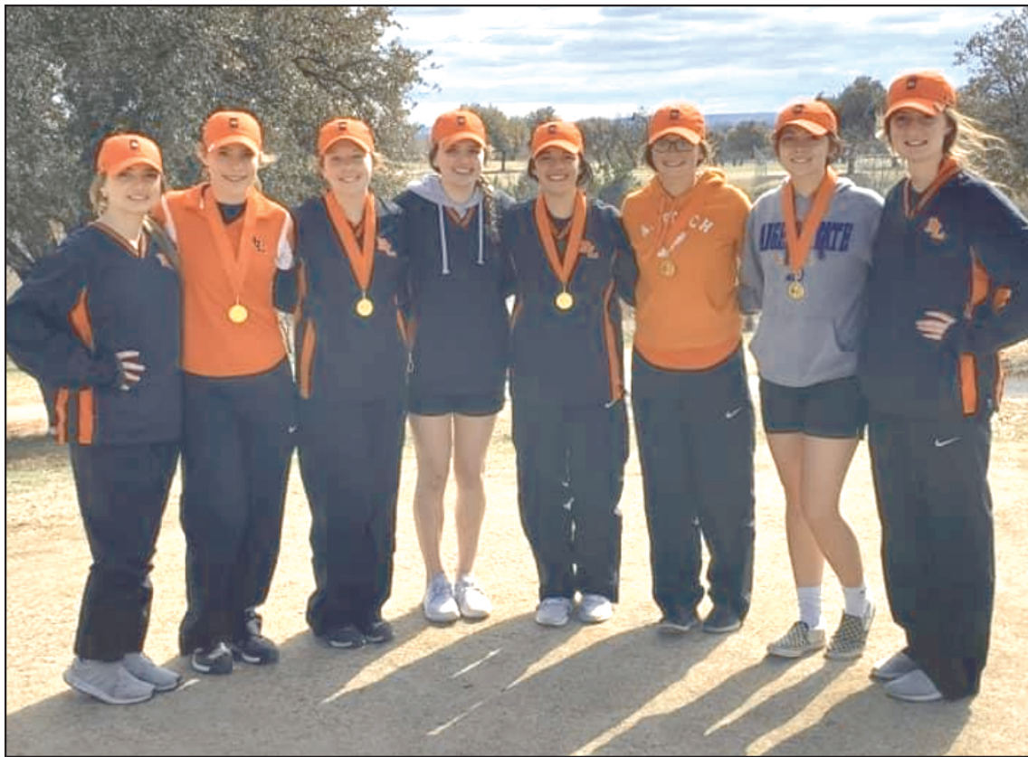
First Place! Robert Lee High School recently hosted a golf tournament on Monday, March 1, 2021, and the Lady Steers placed first on the home course.