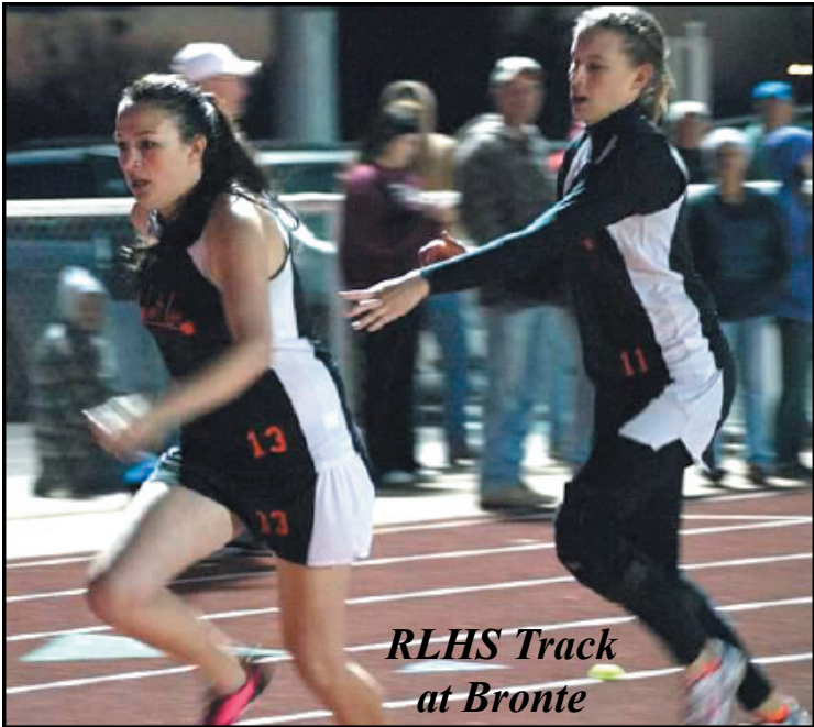
RLHS Track at Bronte