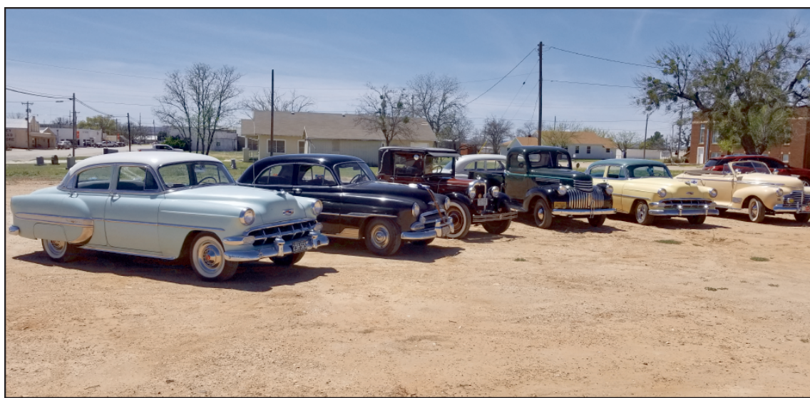
Classics! The Chevrolet Car Club visited Coke County on Thursday, April 4, 2019. They first made a stop at Fort Chadbourne and then traveled on to Robert Lee, where they enjoyed a lunch prepared by the ladies at First United Methodist Church.

Per Year in Coke County ... $30.00 Per Year Elsewhere in Texas ... $35.00 Per Year Outside of Texas ... $37.00