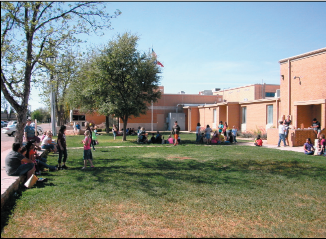
Spring Picnic! Students at Bronte Elementary School recently enjoyed eating a sack lunch outside on a beautiful spring day.