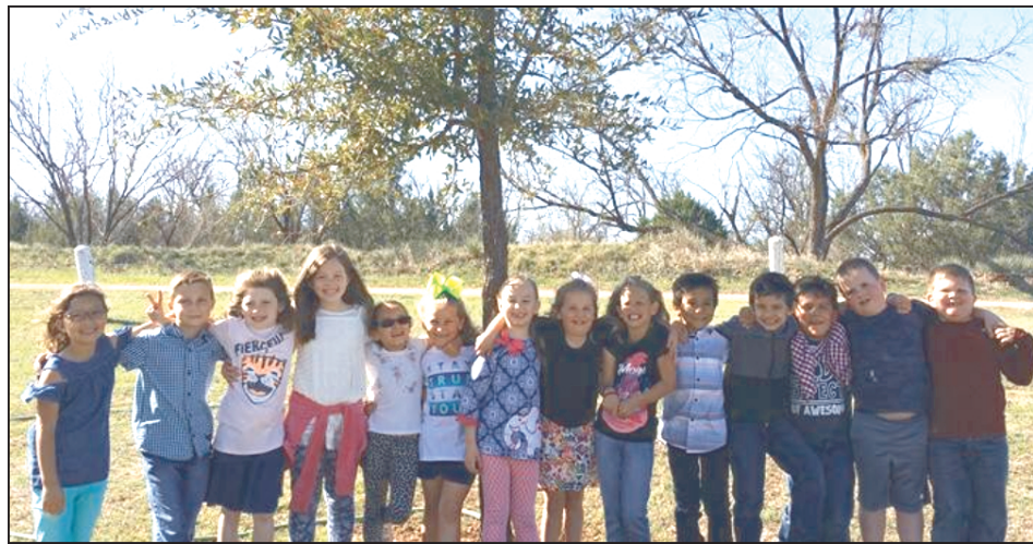
Easter Egg Hunting! Local children enjoyed themselves at Bronte Health and Rehab Center's Easter Egg Hunt (right photo) and the Easter Eggstravaganza hosted by First Baptist Church of Bronte.