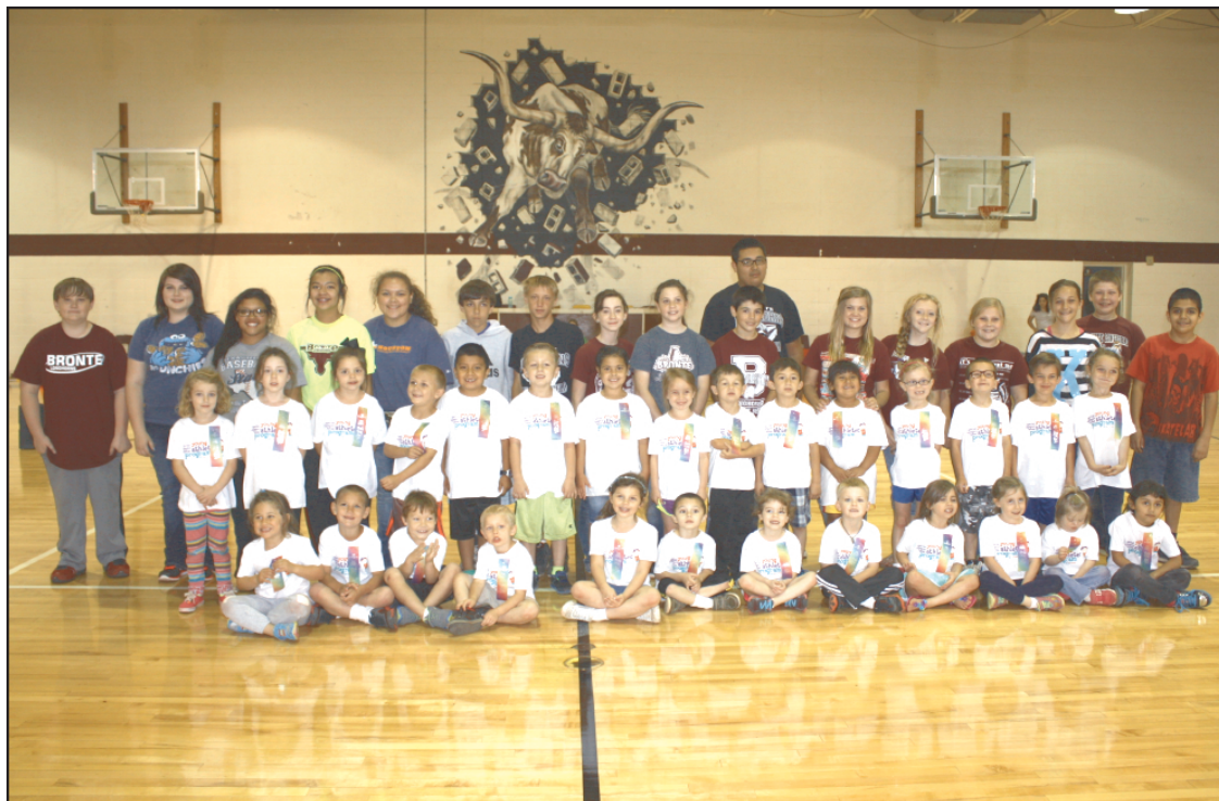
Stars! The future Stars Sports Day (Young Athletes Programs), offered through SOTX, Special Olympics Texas, was held at Bronte Elementary on Friday, April 3. Pre-K and Kindergarten students participated in this special event.