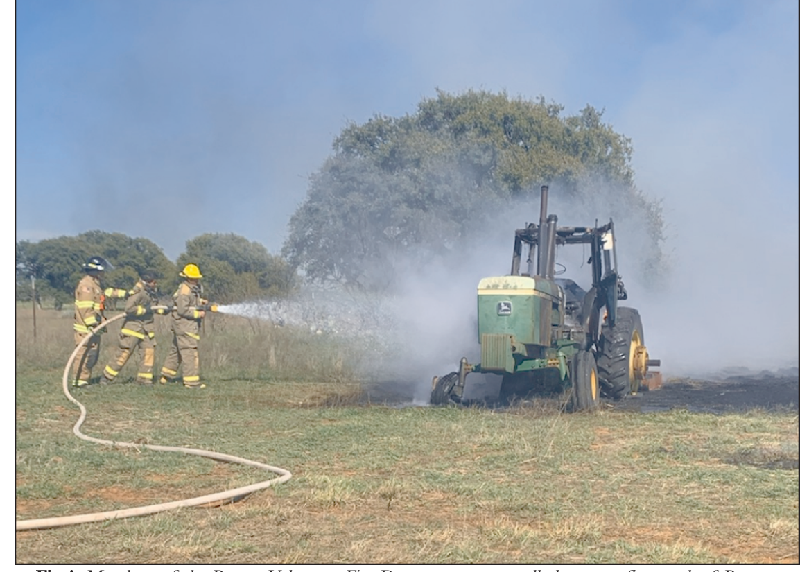
Fire! Members of the Bronte Volunteer Fire Department were called out to a fire north of Bronte on Wednesday, March 25, 2020. A tractor belonging to a local man caught fire and was extinguished by Bronte VFD.

farmer, and mayor in Stamford, and the creator of the