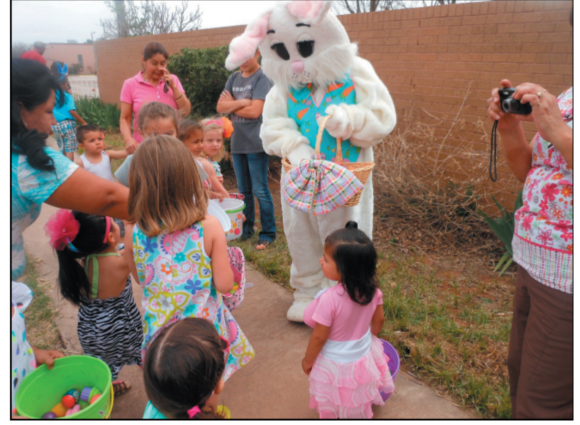
RLCC Celebrates Easter! Robert Lee Care Center had their annual Easter Egg Hunt on March 29, 2013. The children collected over 400 eggs and had refreshments and a visit from the Easter Bunny. The residents enjoyed watching the children hunt easter eggs.

(Continued on page 7) State water funding