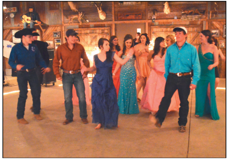
BHS Prom! The Bronte High School Junior, Senior Prom was Saturday, March 23, 2013. It was "A Night Under the Stars" at the Lee Ranch as the students enjoyed their meal, fun and dancing.