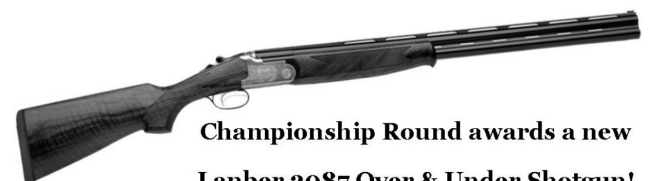
Championship Round awards a new Lanber 2087 Over & Under Shotgun!