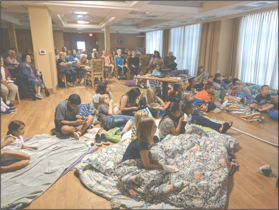
Family Movie Night! Robert Lee Care Center hosted a family movie night for the community on Friday, April 7. The new movie “Sing” was shown. Drinks, popcorn and pickles were provided to a great turnout. RLCC plan more in the future. Looking forward to seeing y’all then!

canned vegetables, canned juices, pasta, rice, dried beans and peas, crackers, breakfast foods, condiments, any non-perishable food item will be gratefully accepted. No glass items please.