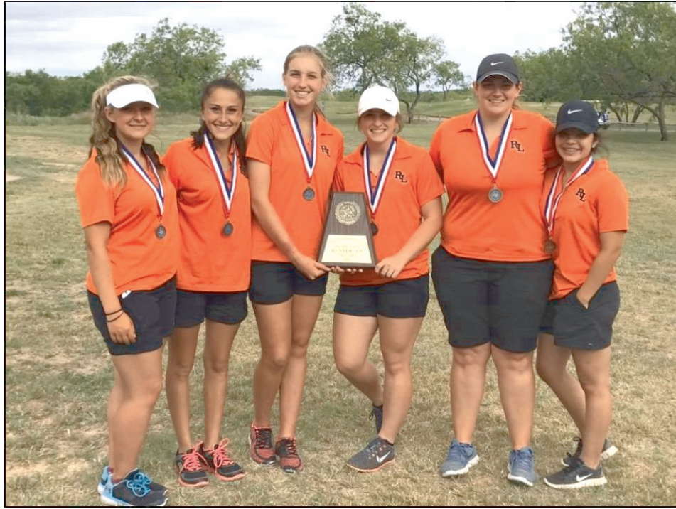
Lady Golfers! Coke County lady golfers made a clean sweep of the #1 and #2 spots at the District golf tournament earlier this month. The Lady Longhorns (left) took the Championship and the Lady Steers were Runner-Up.