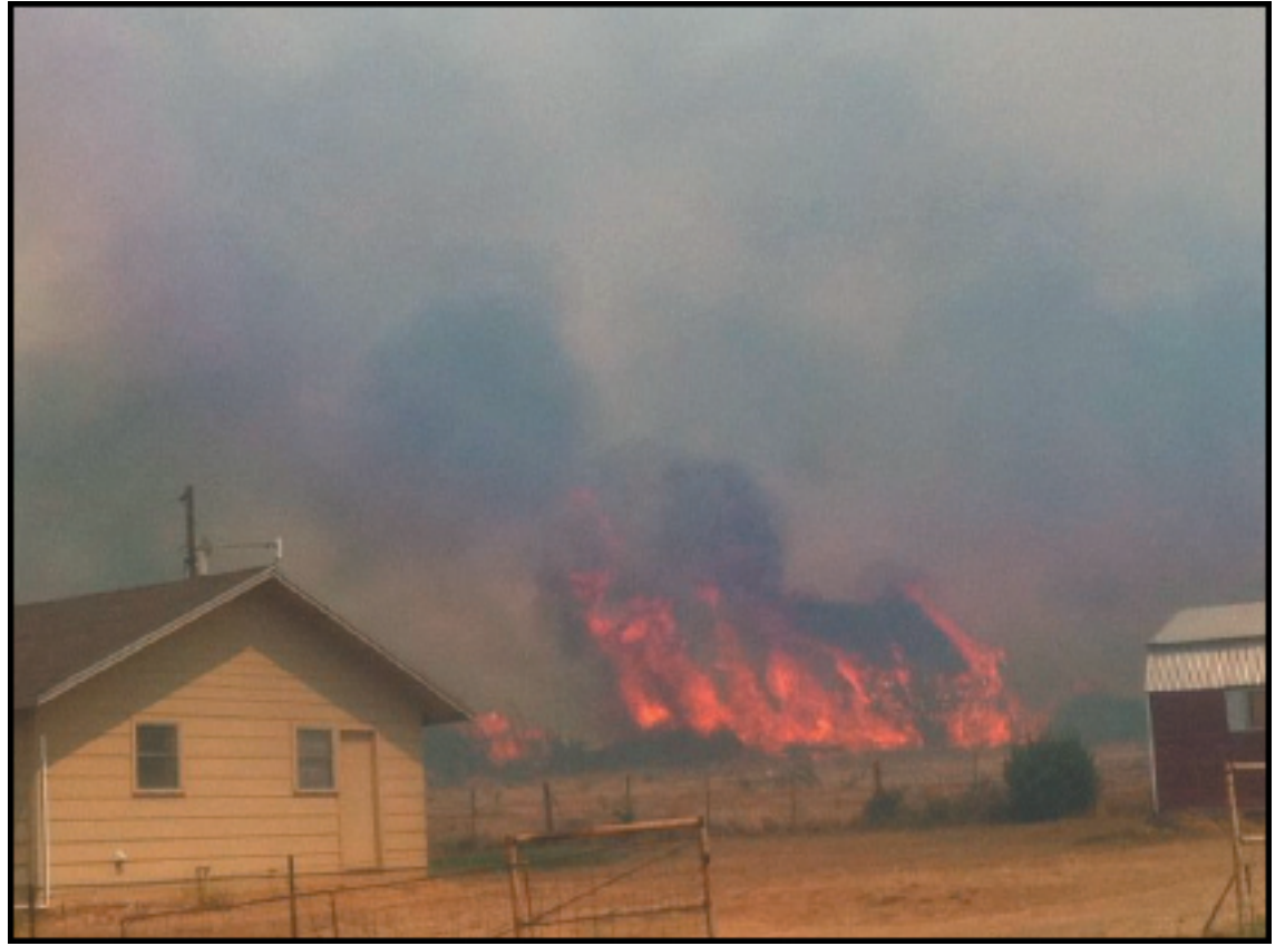
This house on the Blackburn Ranch on Highway 208 was spared due to efforts of firefighters on the scene.