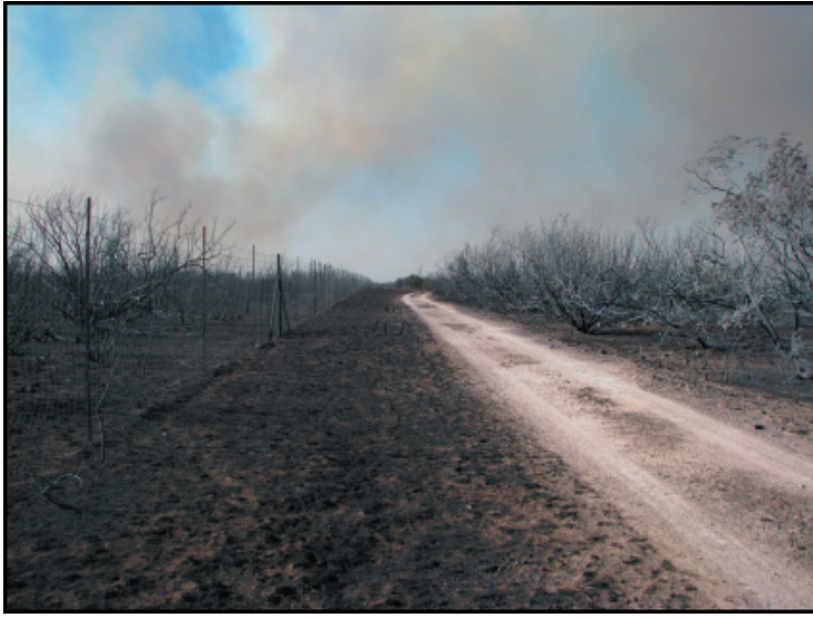
Wildcat Mountain Ranch after the fire.