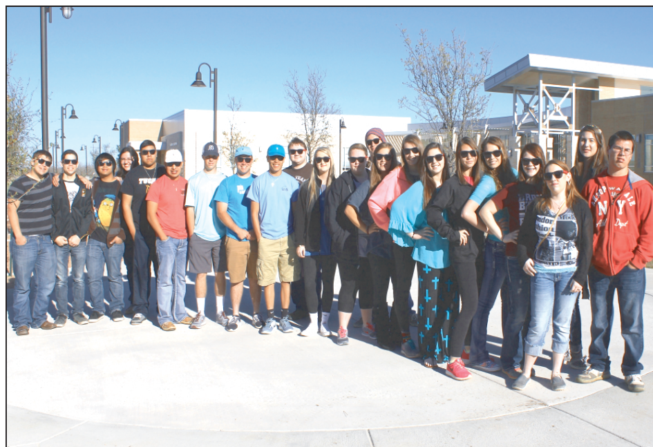
Campus Tours! The senior class at Bronte High School (above) recently visited the campuses of Howard College and Angelo State University. The students were given a tour of the campuses and learned about the different academic programs and services each campus provides. The students also had the opportunity to ask questions and received literature and souvenirs. The seniors are pictured above at the Howard College campus wearing sunglasses that were given to them by Howard College. For more information on the schools, please visit www.howardcollege.edu or www.angelo.edu .