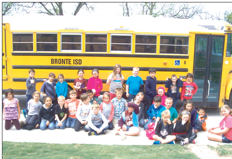
Field Trip Fun! On April 14, 2015, Bronte Elementary 1st and 2nd graders (above left photo) ventured to San Angelo. Their first stop was the Nature Center. Next, they made their way to the Recycling Center, followed by lunch and some serious playtime at Kids' Kingdom. The last stop for the day was a program at the Angelo State University Planetarium.