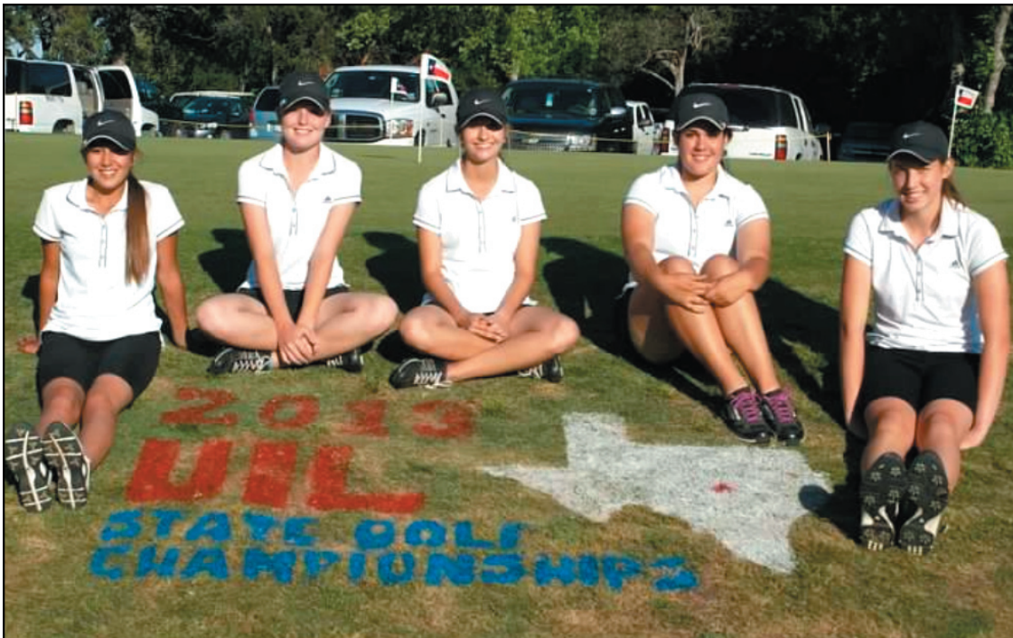
Lady Steers Golf Team! The Lady Steers Golf Team competed at the State Tournament last week at Lions Golf Course in Austin.