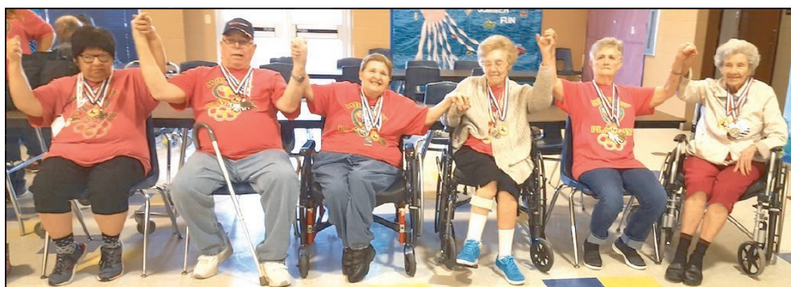
Play Day! Residents from Bronte Health and Rehab Center recently attended the annual Midwest Play Day and competed in various events of the Senior Olympics.

To those of us who love our rural communities, young and old, we all have great memories and value in our Yesterdays. It can become easy to cling to those memories in lieu of taking action for the future. However, future prosperity in our communities depends on how well we manage for our